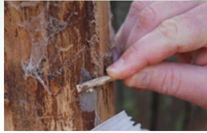
Scraping SLF egg masses from a tree.