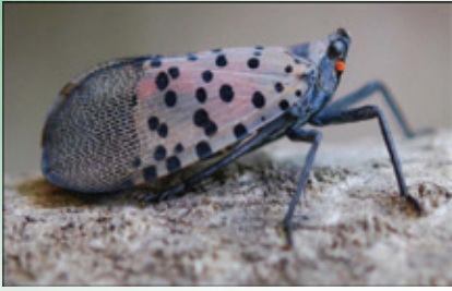
Adult, wings closed (Actual size = 1 inch)