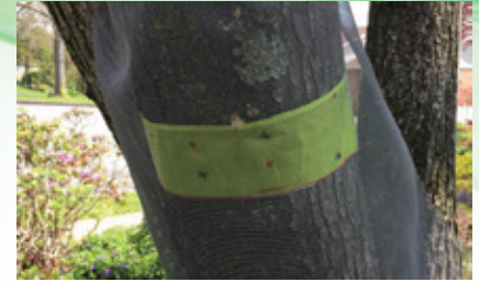
Tree Traps to Catch Nymphs

tree for SLF, and current management efforts are focused on removing it or using it as a trap tree by treating it with insecticide. Tree-of-heaven grows rapidly; it can reach up to 100 feet tall and 6 feet in diameter