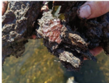
Photo 13 - Removed from bank indicative of pre-settlement floodplain conditions.

TCCCA is actively seeking new members and volunteers interested in helping with a variety of educational and hands-on opportunities. In addition, if you are a landowner interested in improvements to your stream, we would love to work with you. Contact Monique Dykman, mdykman@londonderrypa.org , Matt Royer, mroyer@psu.edu , or visit www.conewagocreek.org to learn more.