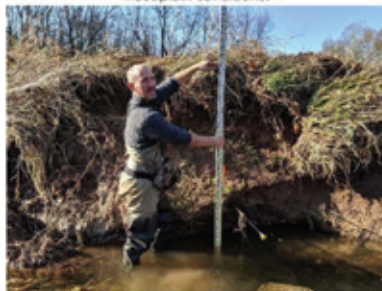
Photo 15 - Aggressive erosion on left bank causing bank pins to drop into channel.