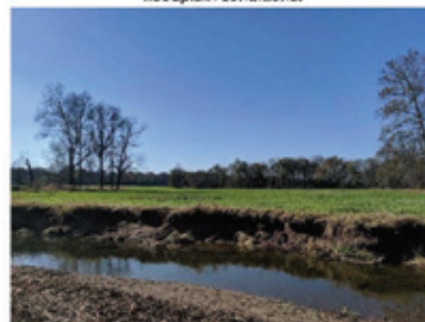
Photo 16 - Extreme erosion on concave bank upstream of Brills Run confluence.